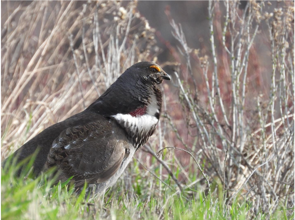
A Dusky Grouse displays near the road in Black Canyon of the Gunnison National Park