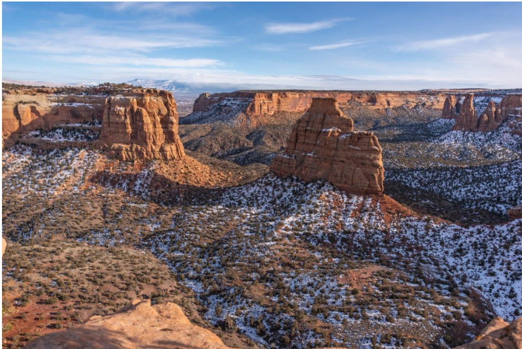
The canyon landscapes at Colorado National Monument will take your breath away