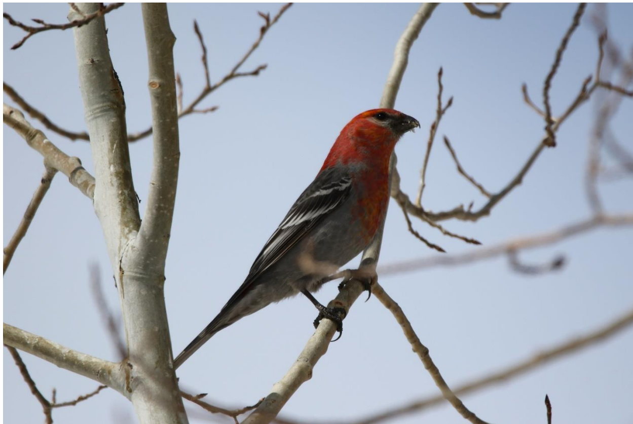
Pine Grosbeaks visit feeders in the mountains of Summit and Grand Counties