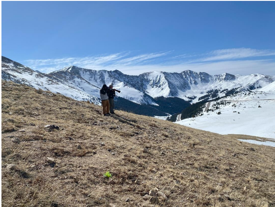
Photographing ptarmigan at Loveland Pass