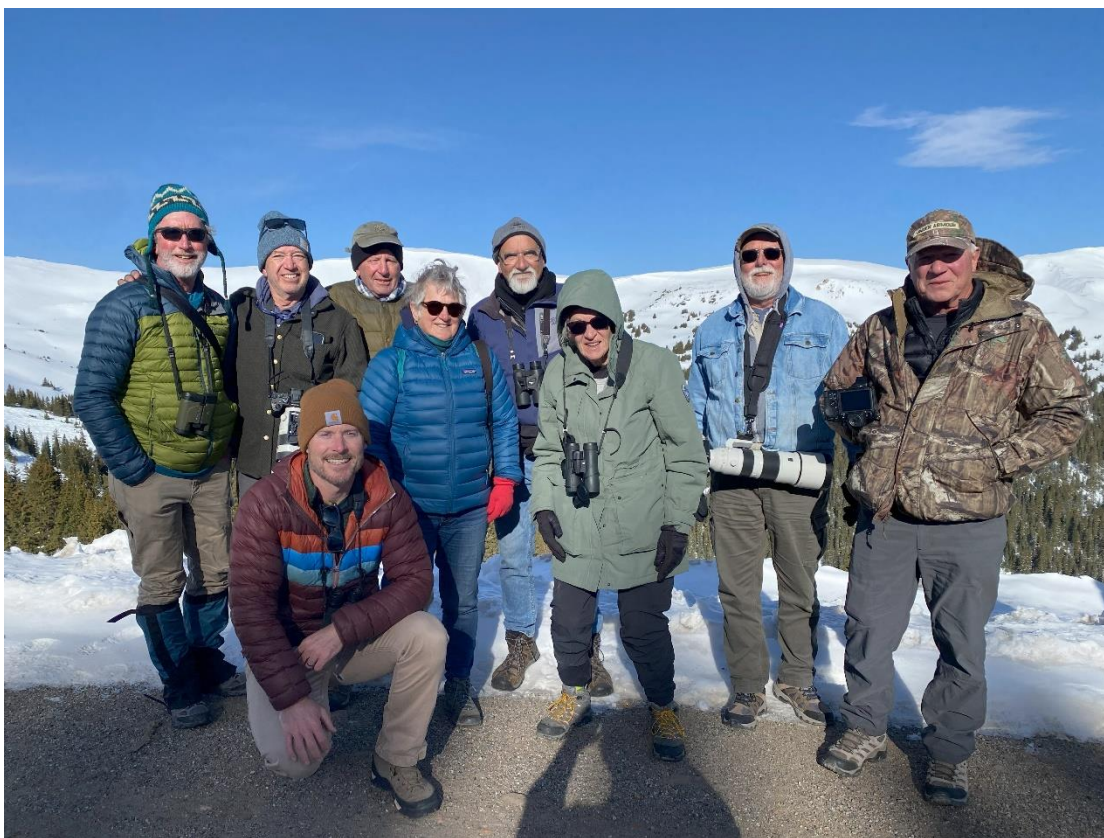
Our group in 2025 trying to stay warm on top of Loveland Pass