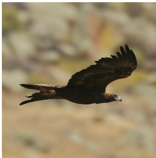
A Golden Eagle soars past us near Black Canyon of the Gunnison National Park

Meals included: Breakfast, Lunch, Dinner