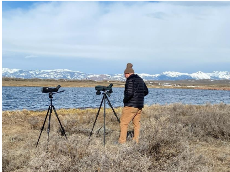
The Arapahoe National Wildlife Refuge protects over 24,000 acres in the middle of North Park