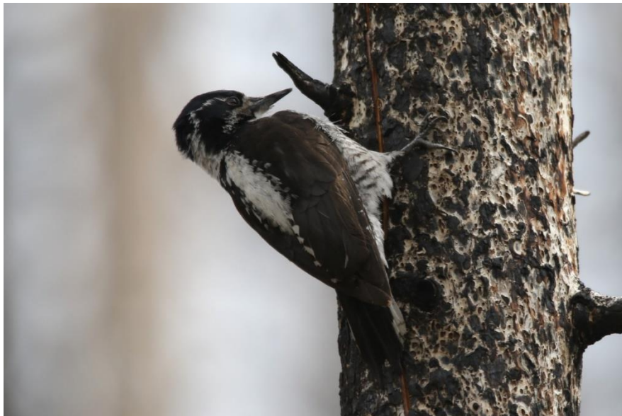
The American Three-toed Woodpecker can be found foraging in stands of beetle-infested trees near Rabbit Ears Pass

Meals included: Welcome Dinner and Trip Orientation