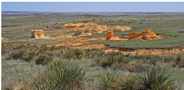
The Plains of western Kansas are strikingly beautiful

Meals included: Breakfast, Lunch, Dinner