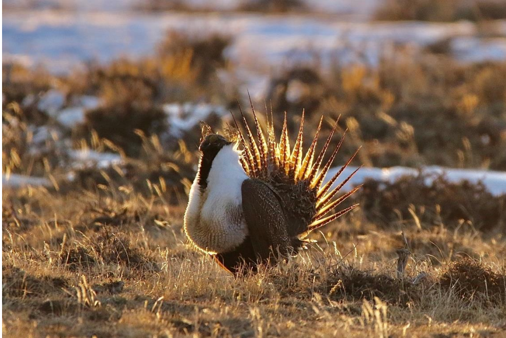
The Greater Sage-Grouse displays regularly south of Walden during the month of April