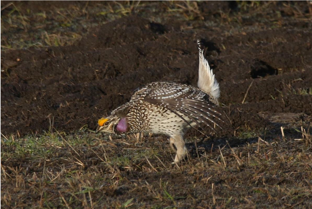
Sharp-tailed Grouse can be found displaying in the agricultural fields northwest of Steamboat