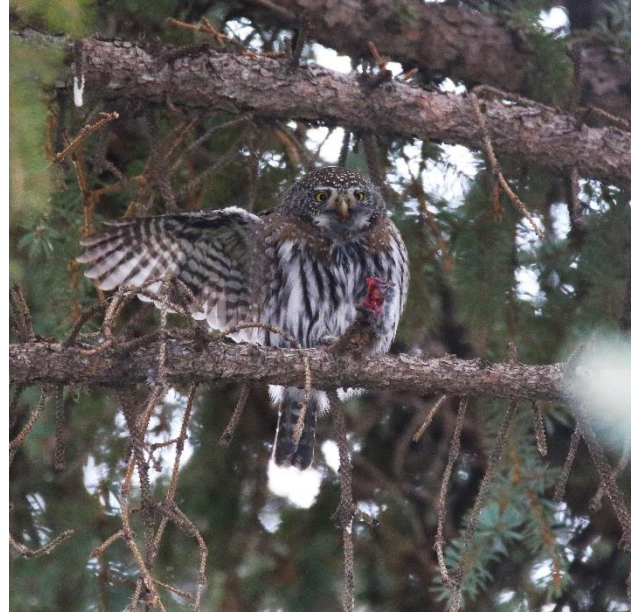
Northern Pygmy Owls breed in the Cache de la Poudre River Canyon