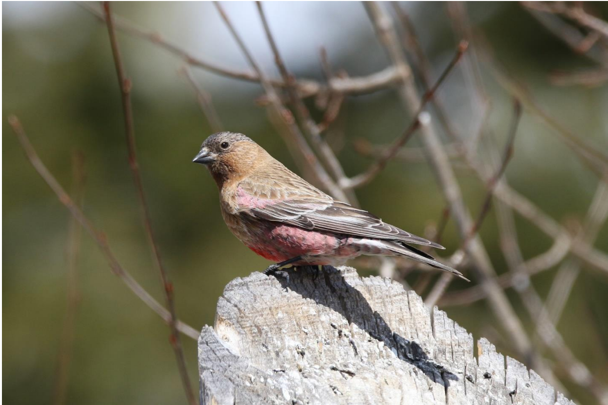
The Brown-capped Rosy-Finch is one of three species of Rosy-Finch that we can find frequenting feeders near Silverthorne.