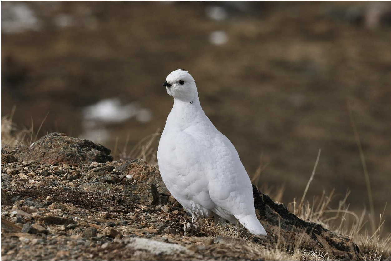
White-tailed Ptarmigan in its winter plumage at Loveland Pass