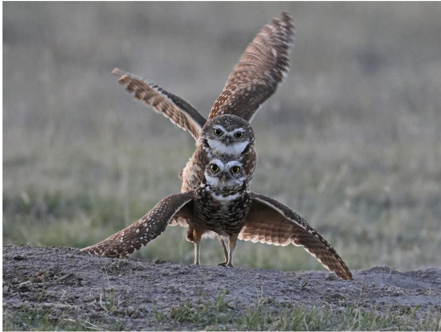
Mating Burrowing Owls near Wray, Colorado