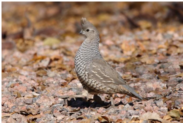
Scaled Quail are a fairly common site in the neighborhood of Pueblo West

Meals included: Breakfast, Lunch, Dinner