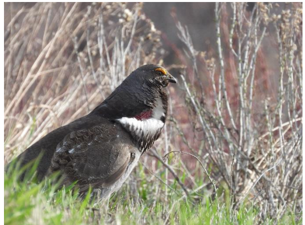
Dusky Grouse will be possible in and around Steamboat Springs and Silverthorne