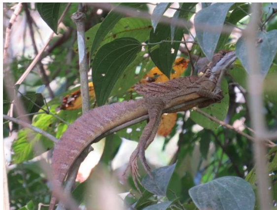
A Basalisk Lizard near La Fortuna