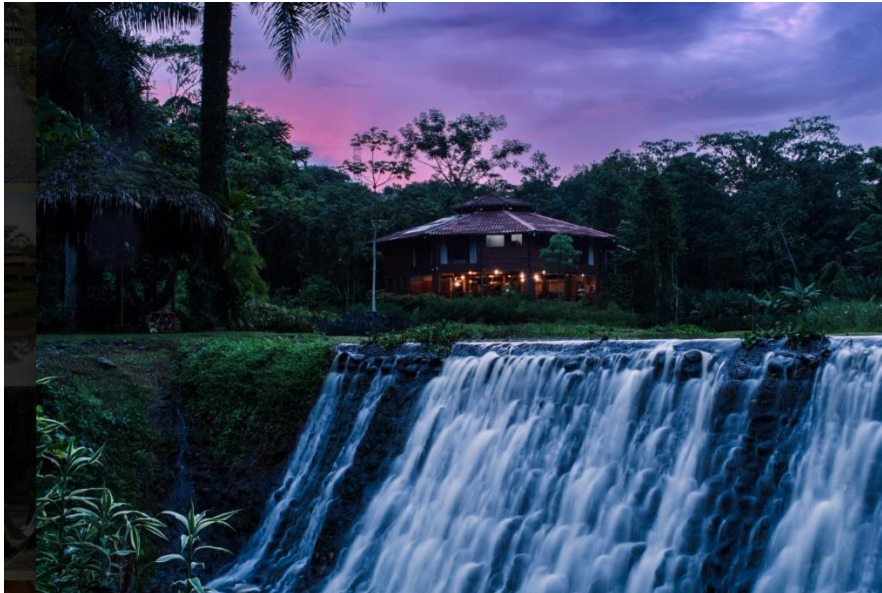
Macaw Lodge is a gem of a place in the middle of the Pacific rainforest