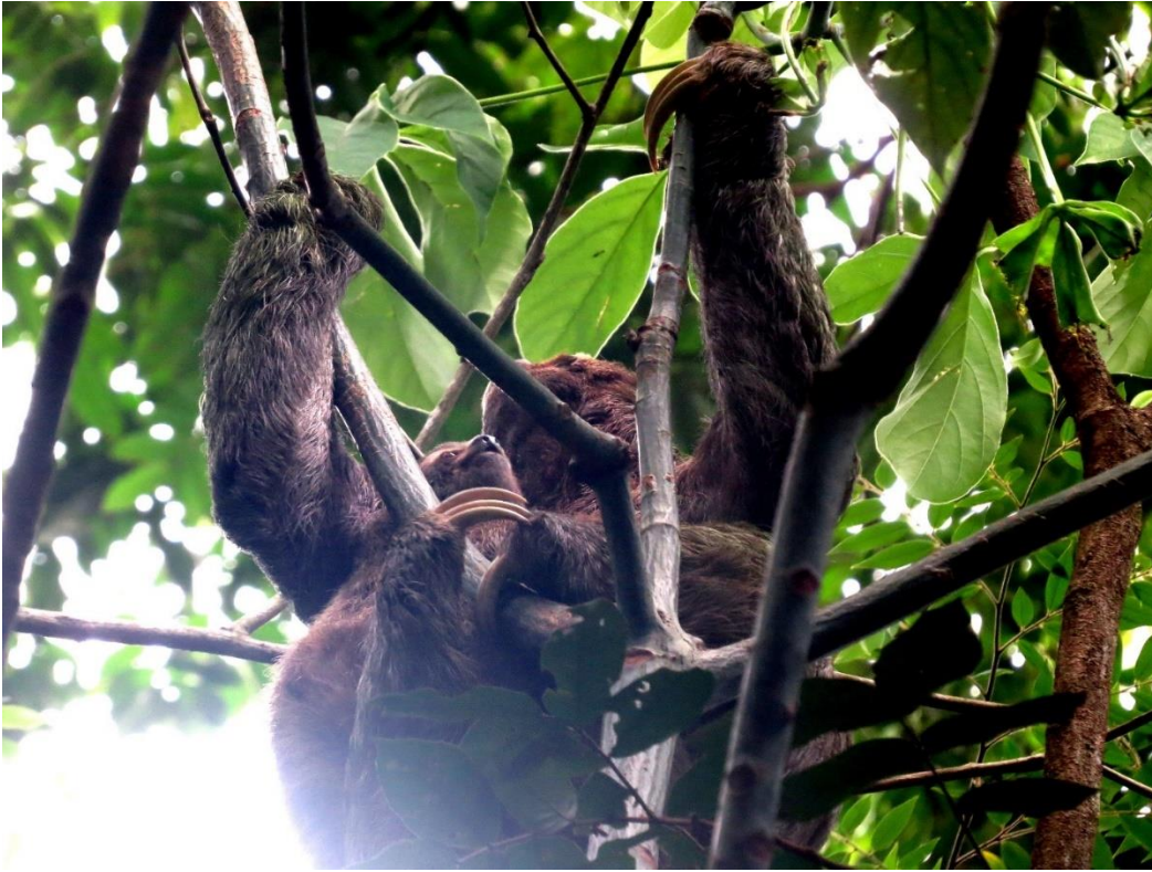
A Sloth and her baby climb into the canopy near Yatama Eco Lodge, Sarapiquí