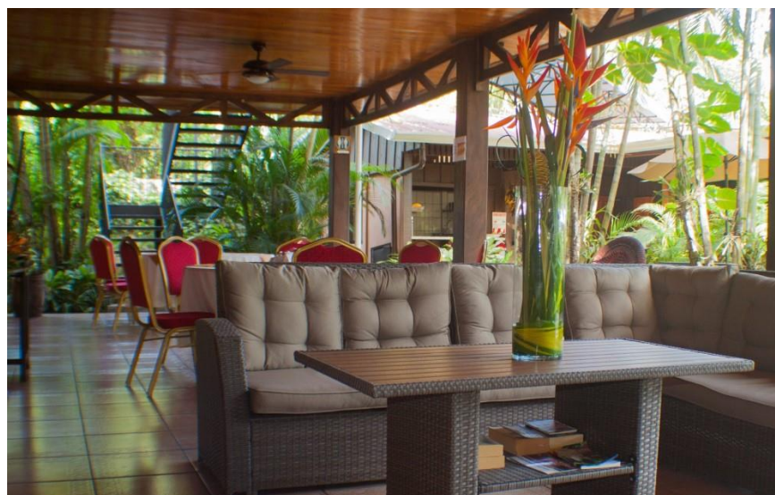
Hotel Robledal is a quiet oasis near the city of San Jose, Costa Rica