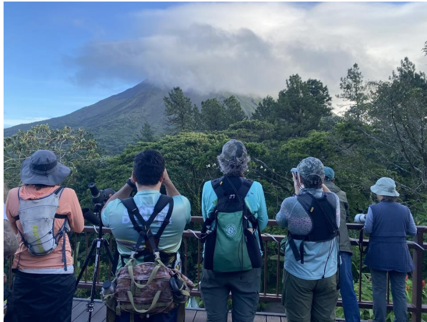
Our group birding near Arenal Volcan National Park