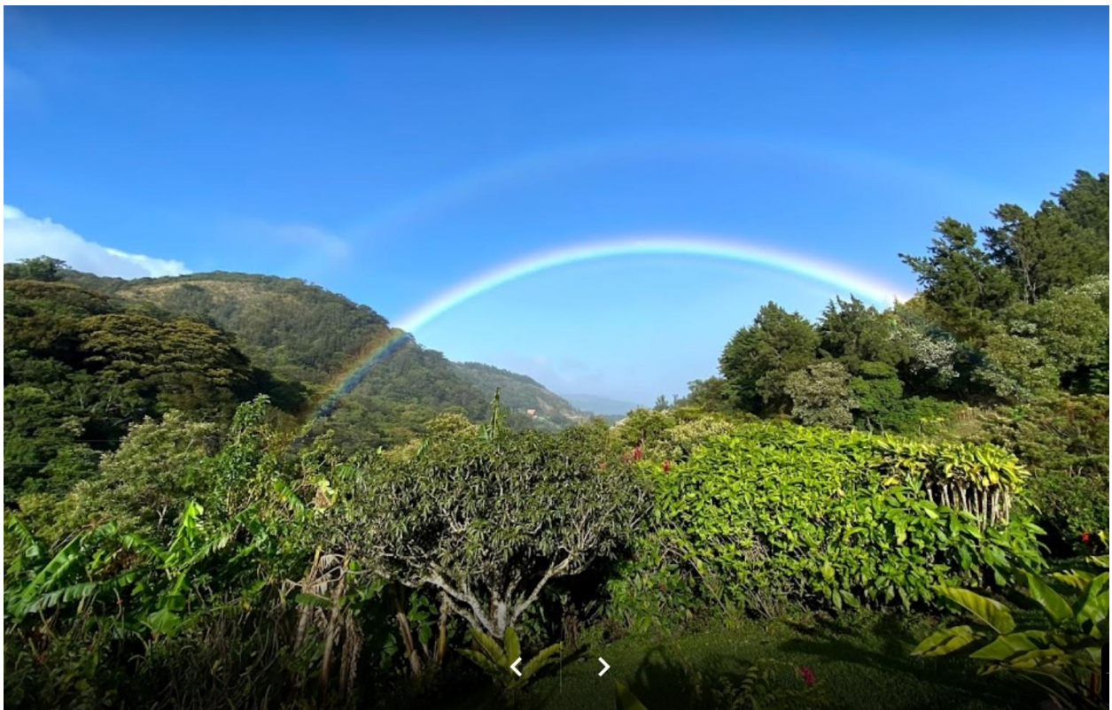
View from the room at Valle Escondido