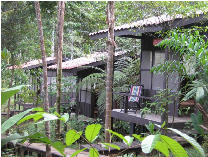
Yatama Eco Lodge is a remote setting with endless opportunities for wildlife exploration. Prepare for endless discovery