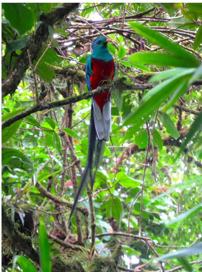
Early March is a great time to search for Resplendent Quetzals near Monteverde because it is the beginning of their breeding season