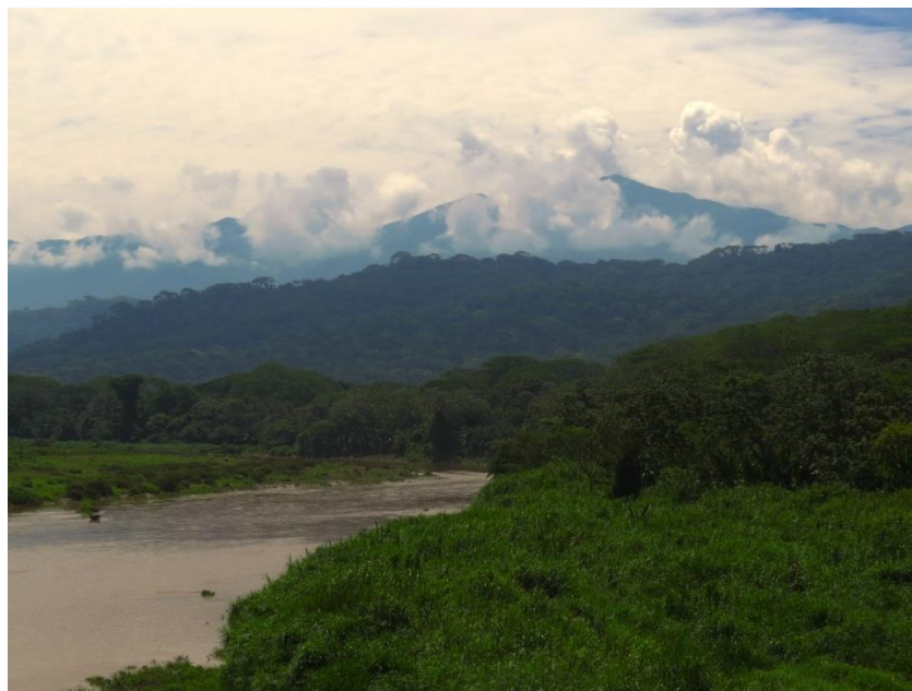
The Tarcoles River is home to one of the densest populations of American Crocodiles in the world