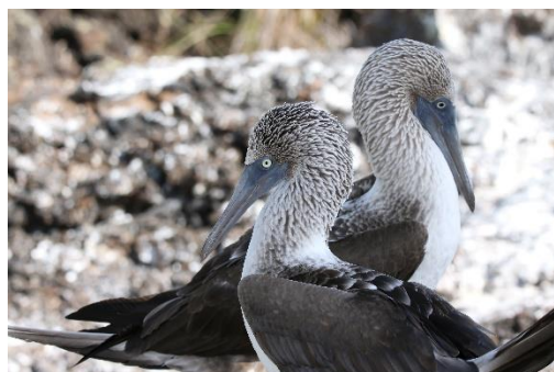
Blue-footed Boobies near Tintoreras