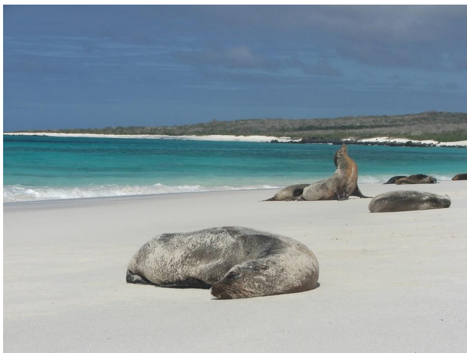
Beach buddies at Playa Gardner