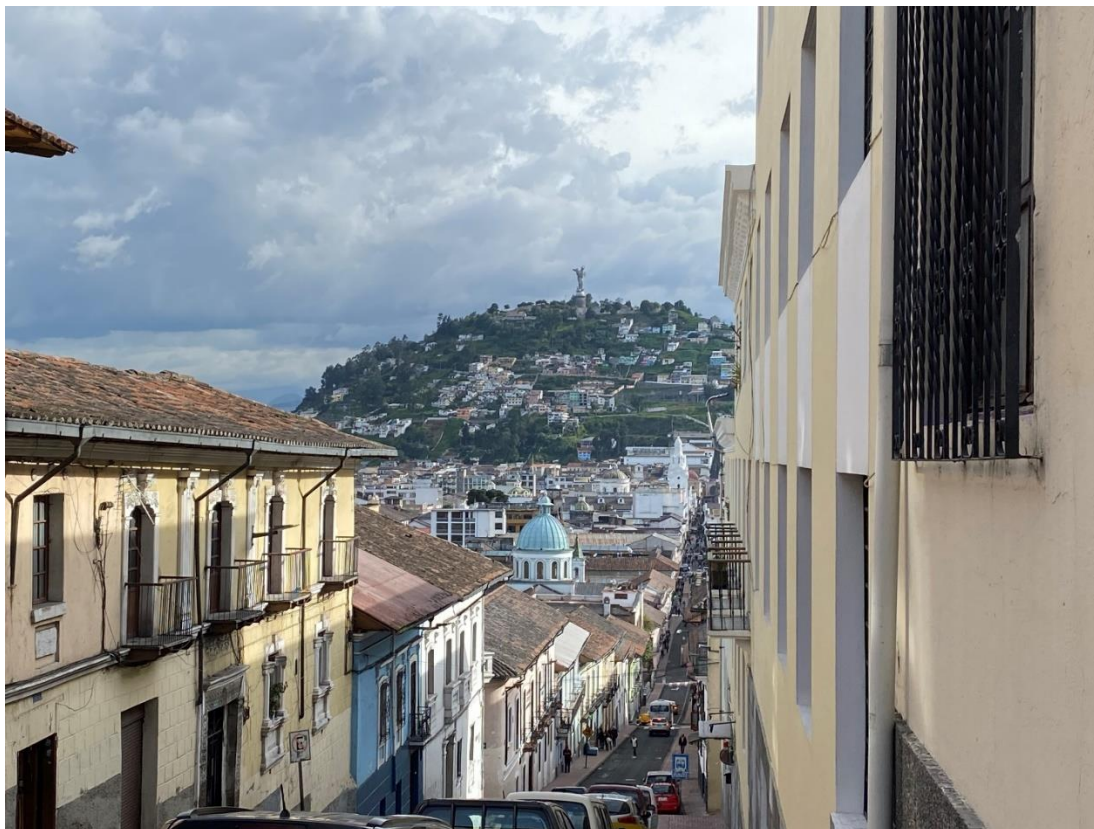
Your guide will greet you at the airport in Quito, Ecuador