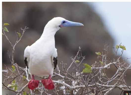
Adult breeding Red-footed Boobies have a bill of pastel pink, blue, and violet

Lodging: Hotel Cactus Meals included: B, L, D