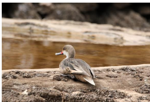
The endemic White-cheeked Pintail