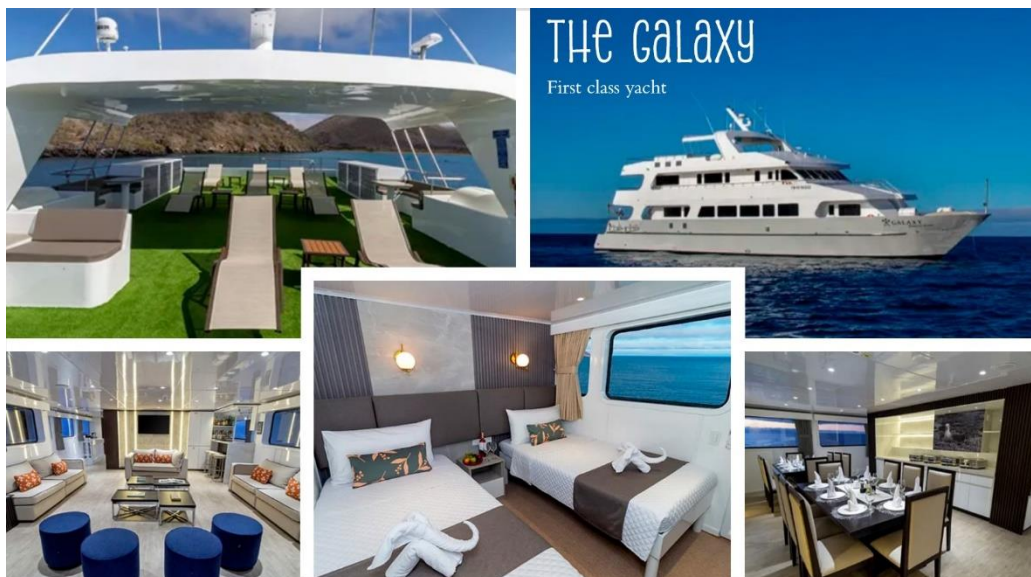
A look at the Galaxy Yacht, our first class vessel