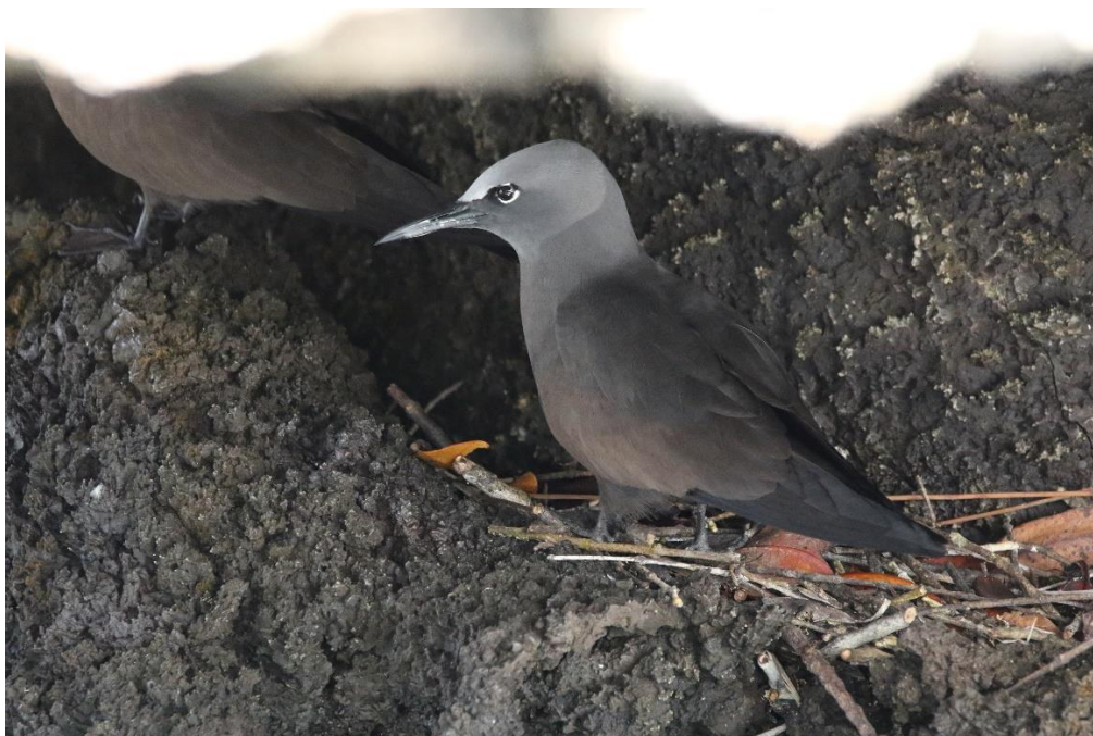
Brown Noddy can be seen while crossing the Itabaca Canal between Baltra and Santa Cruz