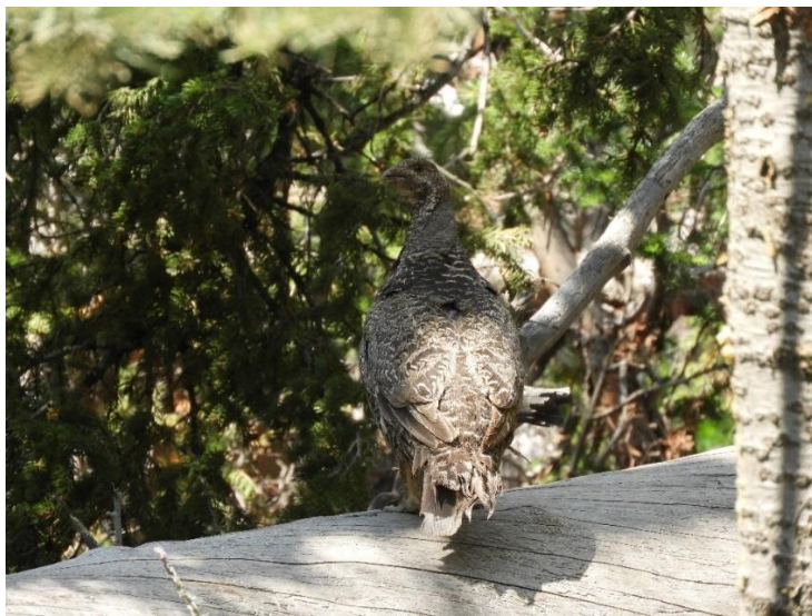
Dusky Grouse are a little trickier to find, so we will spend a couple of days looking for them. Our first attempt will be at Black Canyon of the Gunnison National Park and our second attempt in the area north of Steamboat Splice to find birds of the desert southwest