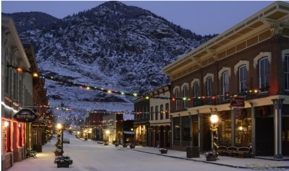
The main street of Georgetown, Colorado looks like it could be right out of a Western movie