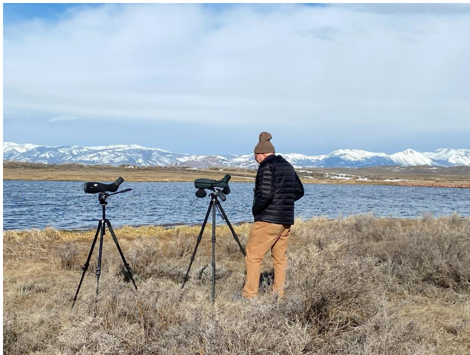
The Arapahoe National Wildlife Refuge protects over 24,000 acres in the middle of North Park