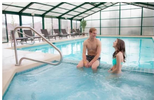
Enjoy a night at the Inn at Tomichi Village near Gunnison, Colorado