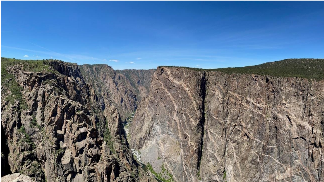
Black Canyon of the Gunnison National Park and its steep canyon walls are home to Canyon Wrens while the surrounding pinyon pine – oak woodlands provide habitat for Dusky Grouse