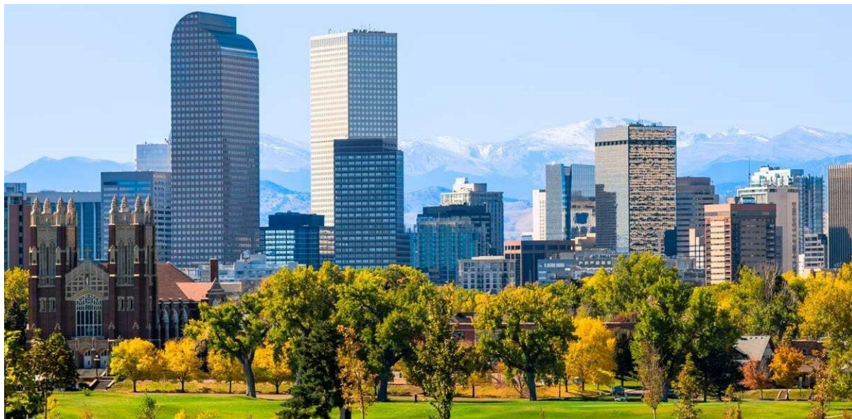
Your guide will greet you at the airport in Denver, Colorado