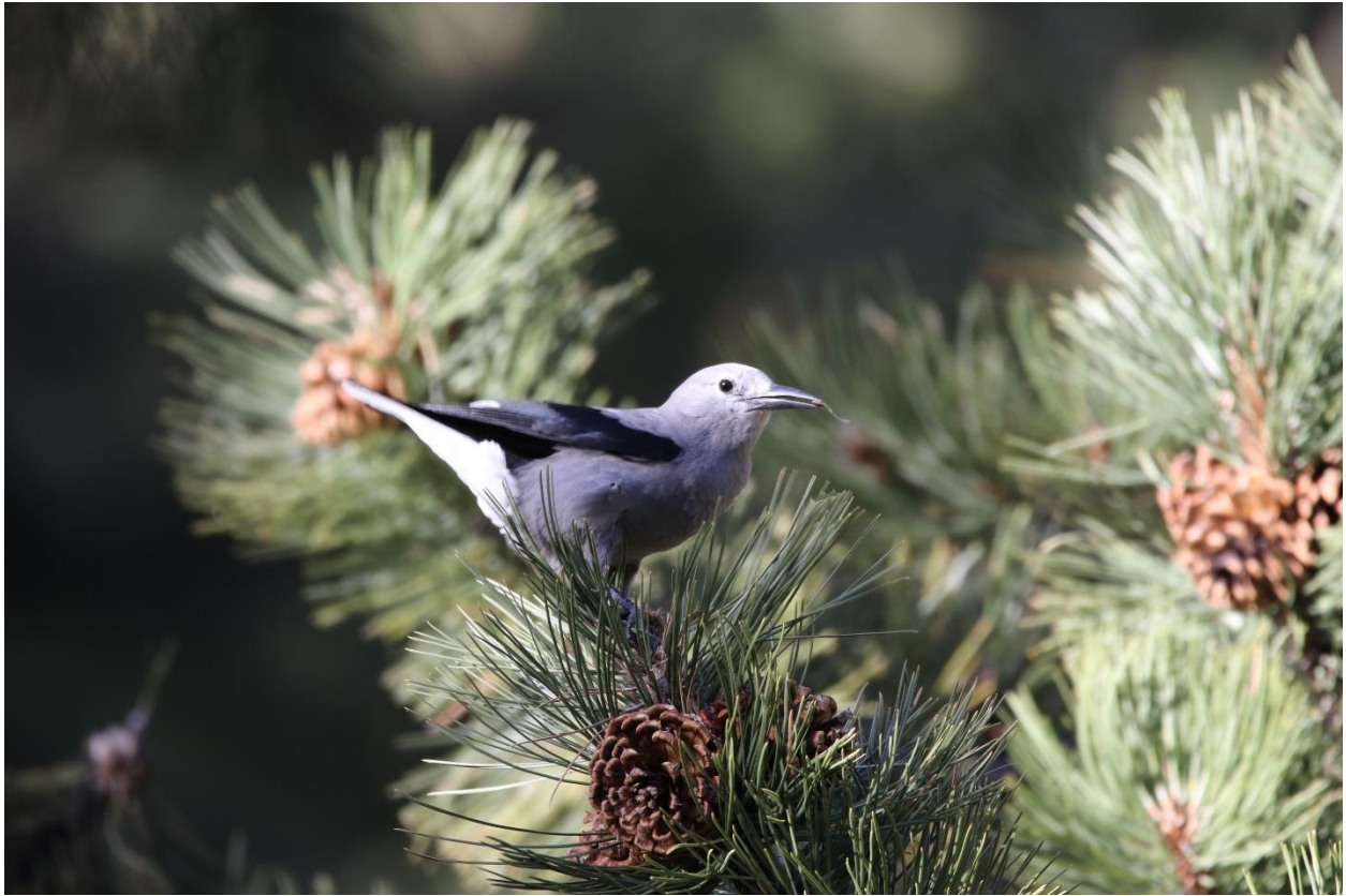
Clark's Nutcrackers can be found foraging for pine seeds in the woodlands and forests around Buena Vista, Colorado